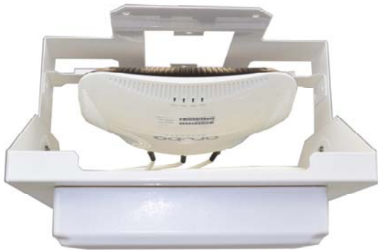
Mount With Aruba AP and TerraWave Antenna

Every Ventev Terrawave product is covered by the company's two-year TerraNet warranty program. For questions or to purchase product, contact a Regional Sales Executive at 410-229-1201, 800-851-4965 or sales@ventev.com.