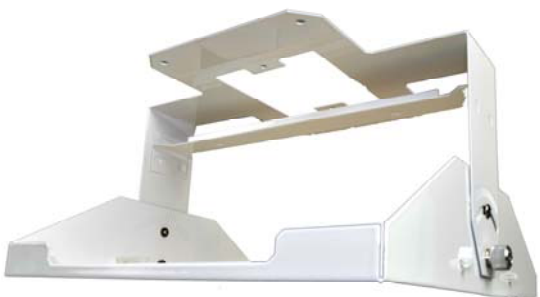
RPSMA Co-Locating Mount without AP and antenna